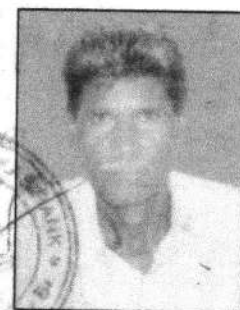
శాఖాధికారి Branch Manager